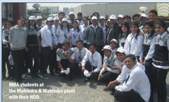
MBA students at the Mahindra & Mahindra plant with their HOD.