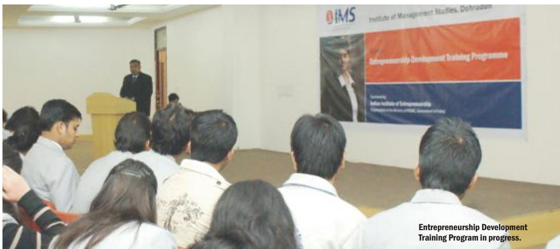
Entrepreneurship Development Training Program in progress.

A two day Entrepreneurship Development Training Program, in association with Indian Institute of Entrepreneurship, an organization of Ministry of MSME, Government of India, was organized for the management students. The purpose of this program was to educate the students about entrepreneurship and the various types of assistance extended by Government of India to small entrepreneurs. The event was a success as it introduced the future entrepreneurs with the ground realities.