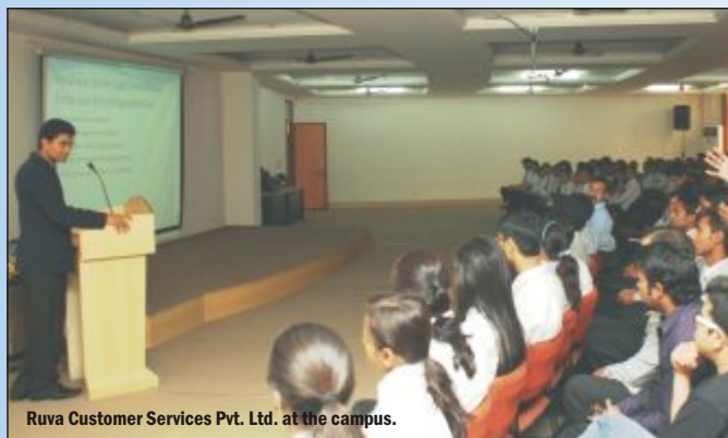
Ruva Customer Services Pvt. Ltd. at the campus.