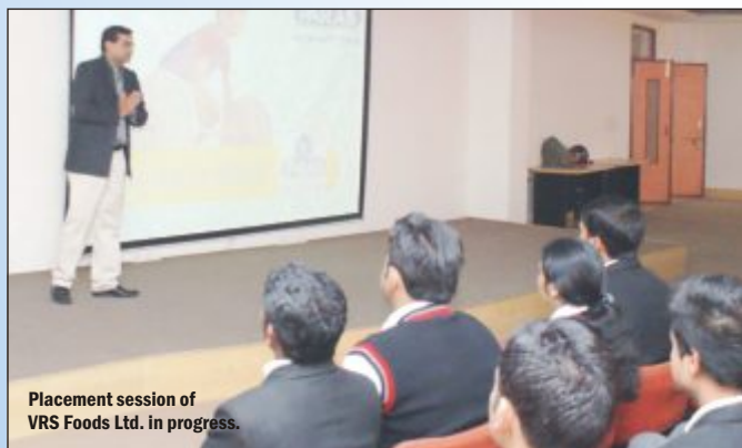
Placement session of VRS Foods Ltd. in progress.