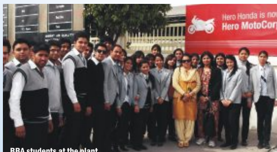
BBA students at the plant of Hero Motor Corp. Ltd.

With all these vigorous activities going on, some of the students discovered some very enjoyable and memorable moments on their trip to Mussoorie and Surkanda Devi Temple.