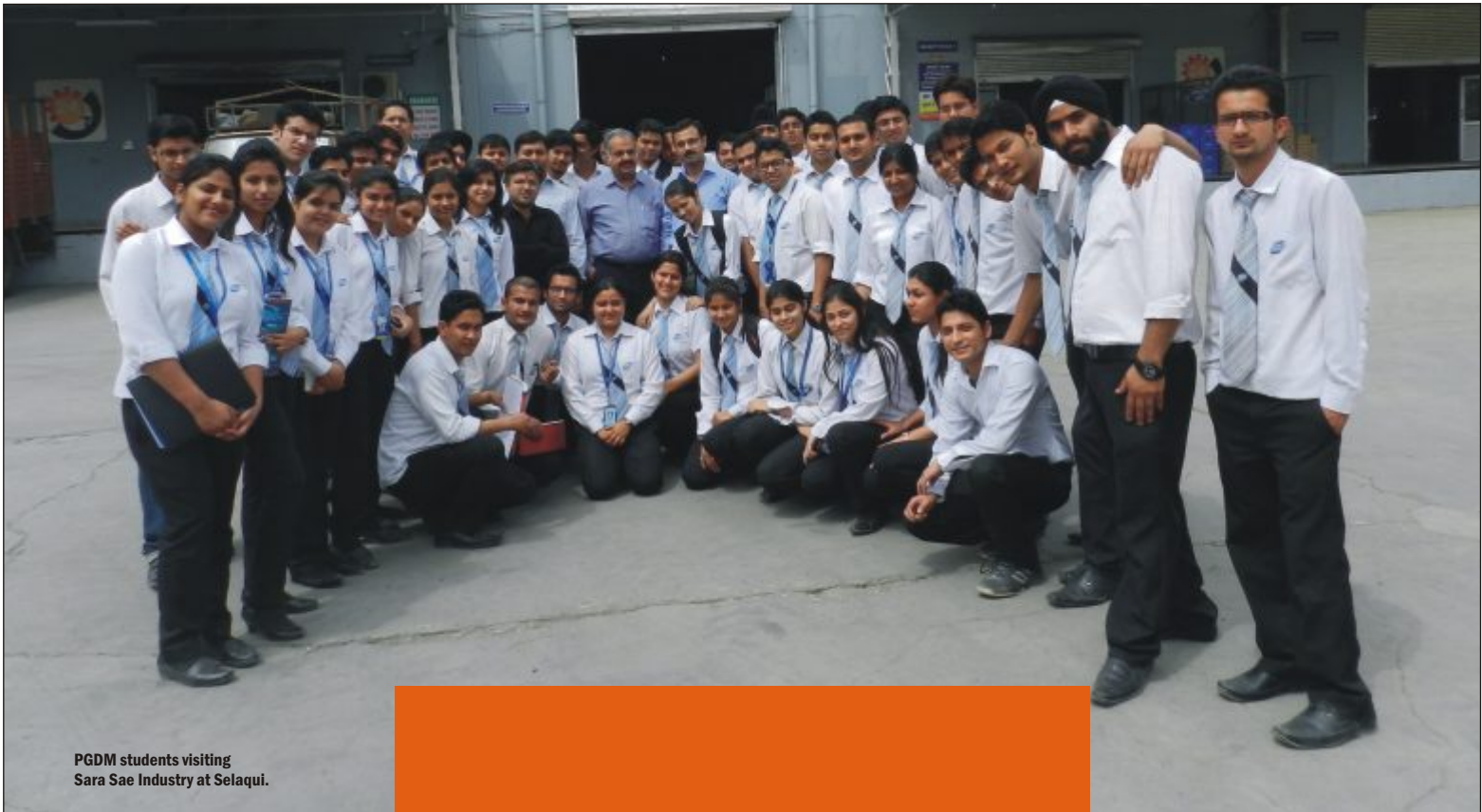
PGDM students visiting Sara Sae Industry at Selaqui.