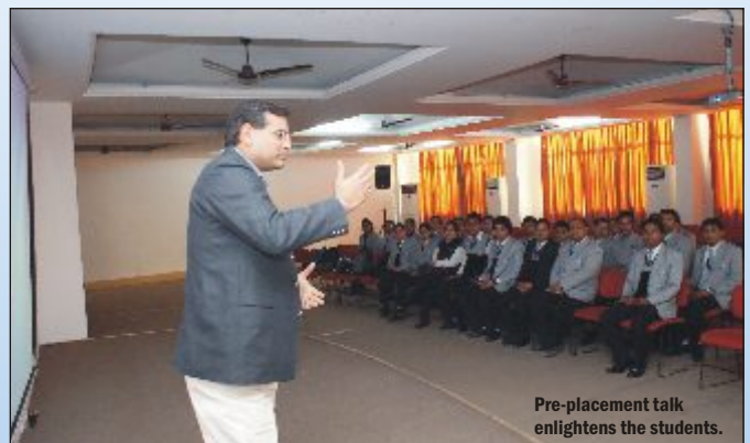
Pre-placement talk enlightens the students.