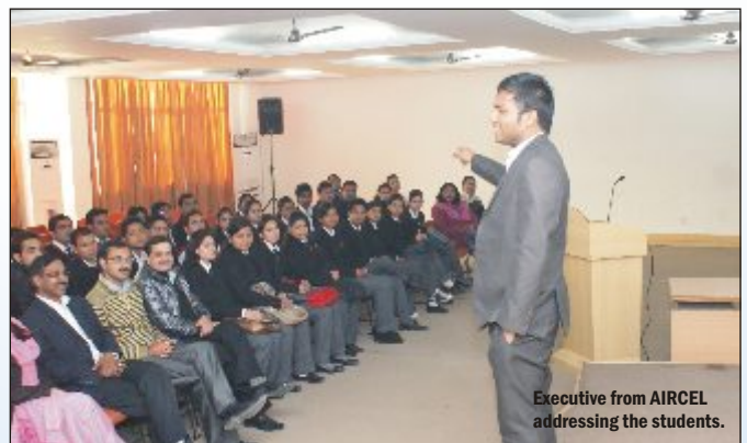
Executive from AIRCEL addressing the students.